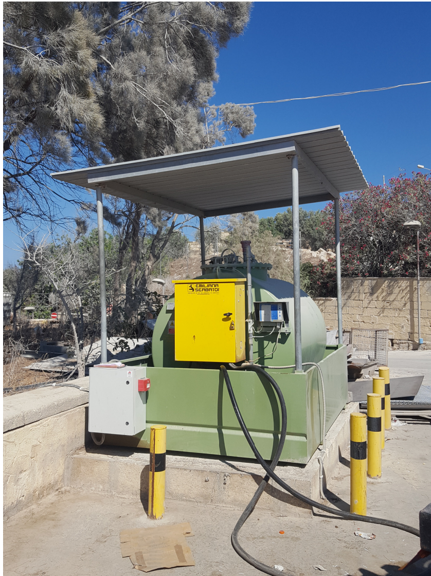
Fig. 01- General View of Bund and its Roofing